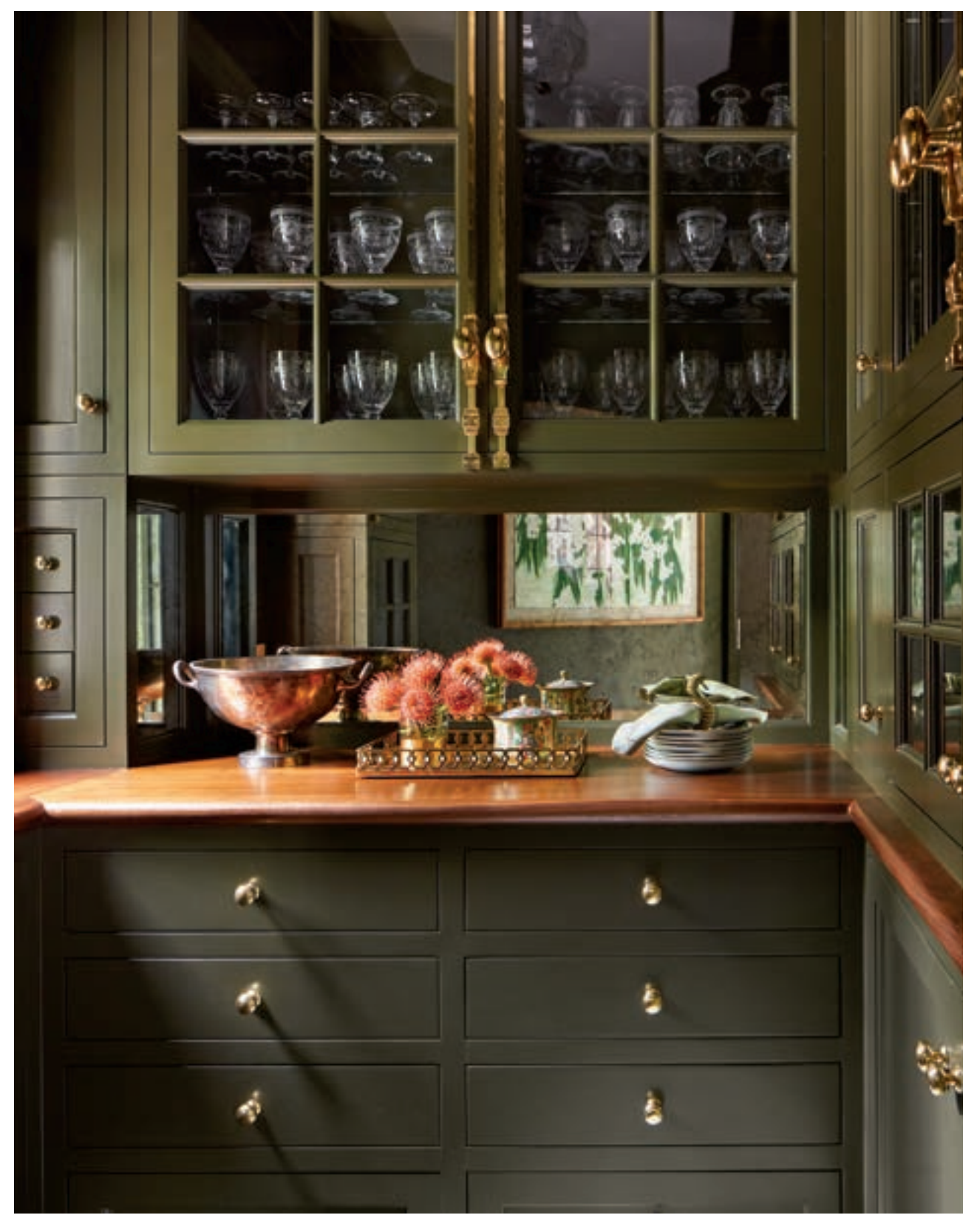
Above: Tucked off the dining room, the petite pantry houses entertaining essentials in style. The cabinetry, painted in Benjamin Moore's River Rock, and walnut counter, both fabricated by Fairfield Woodworks, complement the traditional ethos of the antiqued mirror backsplash.

Opposite: A black-and-gilt chest from Greenwich Living Antiques and Design steals the show in a corner of the dining room. Botanical de Gournay wallpaper, a custom rug by J.D. Staron, petalshaped Dennis & Leen chairs and several sets of French doors lend to the garden ambience.